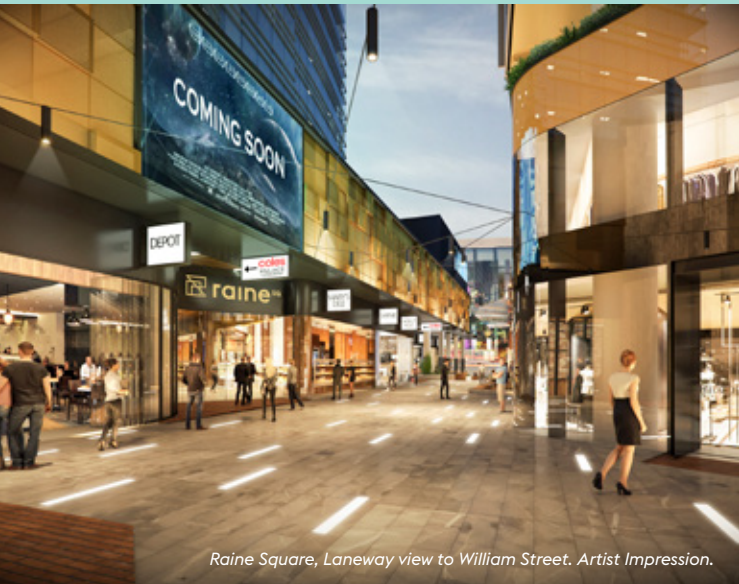
Raine Square, Laneway view to William Street. Artist Impression.